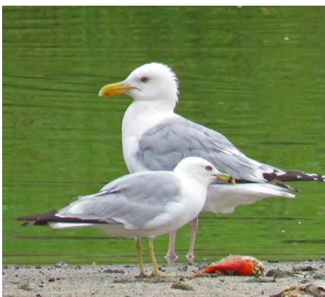
Ring-billed and Herring Gulls

Ring-billed in front. Spring, summer, and fall.